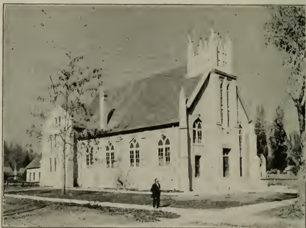
SIXTH WARD MEETINGHOUSE, LOGAN.

When I had been in the mission field something over three